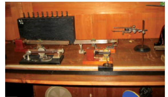
Centre for the History of Psychology

Hotel accommodations for each student will be made in three-star hotels. Each student will share a room, which will be equipped with twin beds and a private bath.