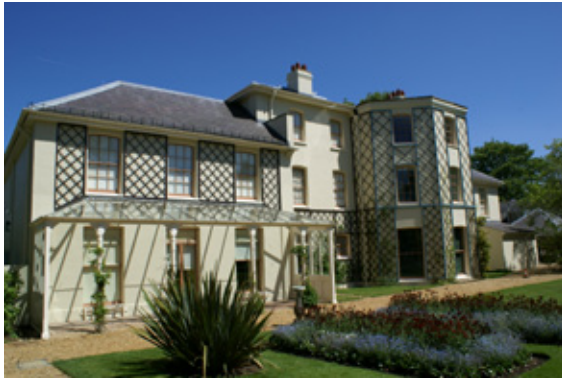
Down House, Charles Darwin's home